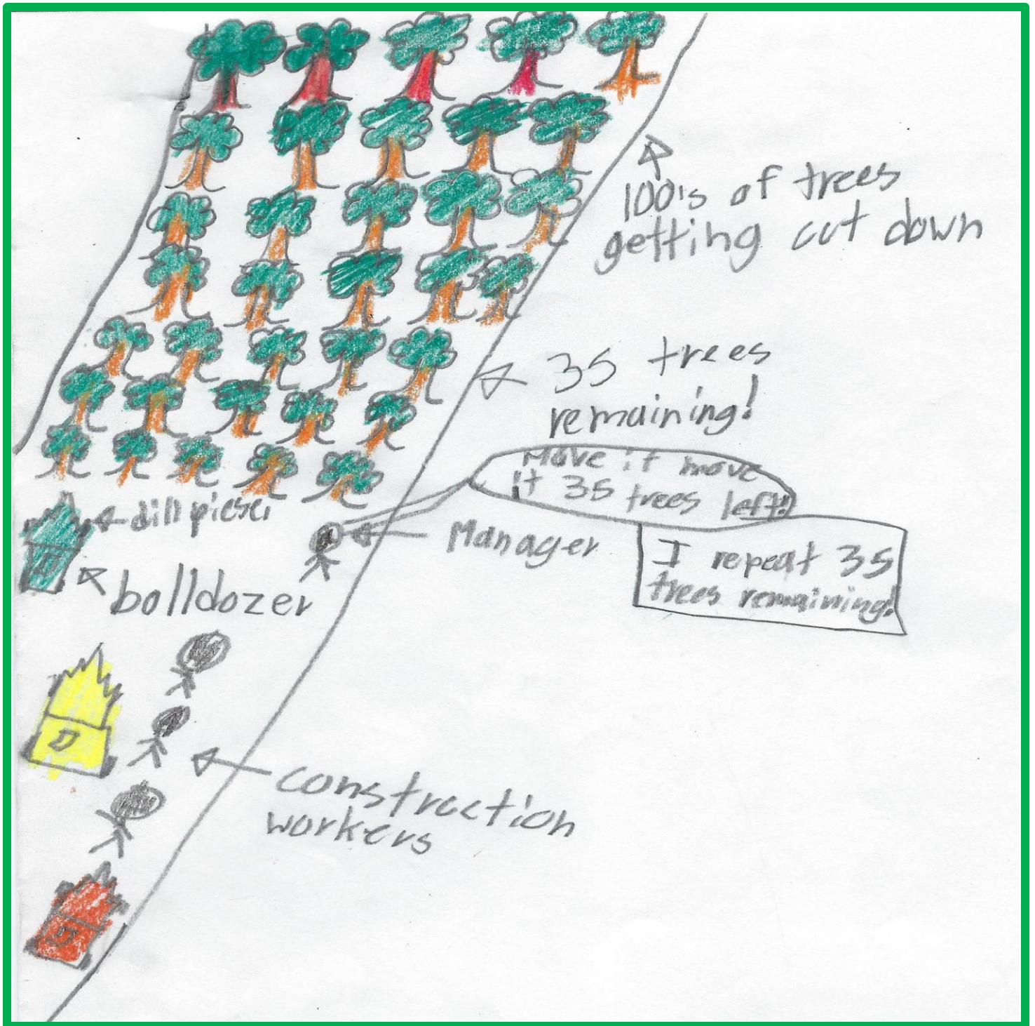
The city bulldozed hundreds of trees